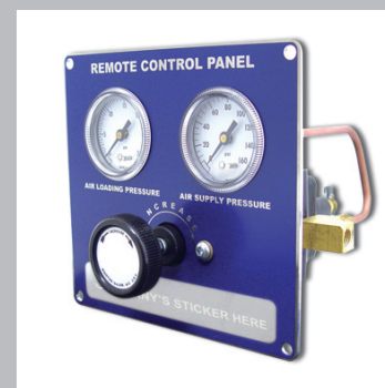
Front View ( Actual Size: 7 ¼" wide x 6 ¾" high x 8" deep )

Same features as RCP-2 Panel without delivery pressure gauge.