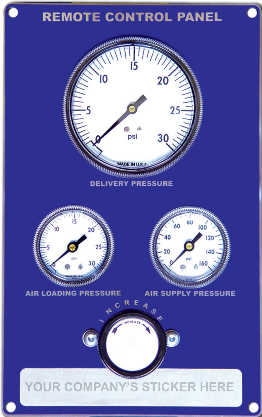
Type RCP-2 Panel Front View (Actual Size: 7 ¼" wide x 11 ½" high x 8" deep)