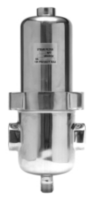
STEAM SCRUBBER FILTER