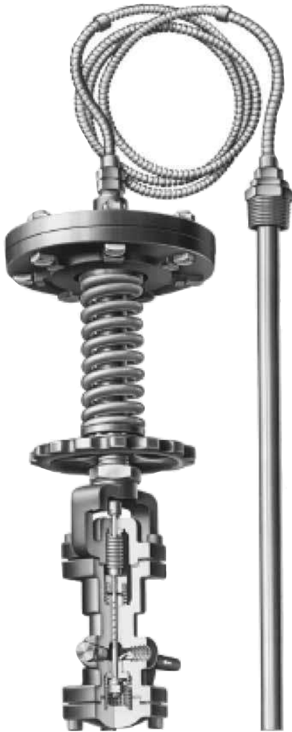
TYPE T52 TEMPERATURE PILOT