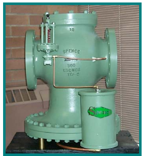
10" Spence Type ED120 Steam Pressure Regulator with Condensate Chamber

A Condensation Chamber is standard on Spence Type E5 Main Valves and on all cast steel, Type E Main Valves when steam temperatures exceed 600°F. The function of the Condensate Chamber is to ensure condensate, and not steam, is transmitted to the main valve hood by providing an external reservoir of water to accommodate the requirements of main valves with large hood volumes.